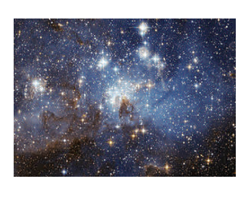
"Reach for the stars."

(1) Editor's note: I speculate it has something to do with being embarrassed, as if "their honor has been impugned." I witnessed a Solano County Administrator accuse a member of the public of impugning his honor, during a public meeting. "Hurt feelings" racket?